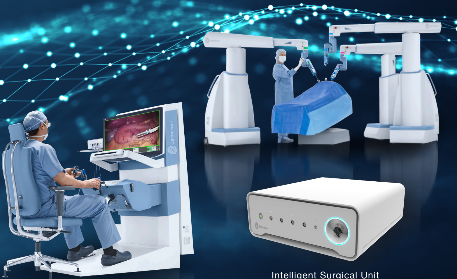
Intelligent Surgical Unit

The Intelligent Surgical Unit is the world's first AI system to be FDA cleared, CE Marked and approved by PMDA for use in robotic surgery.